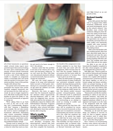
High school in an over-populated city.

What is the value of homework? Homework is a valuable tool for reinforcing classroom learning and developing independent problem-solving skills. It allows students to practice what they've learned in class and receive feedback on their work. However, it's important to strike a balance between homework and other activities, such as sports and family time.